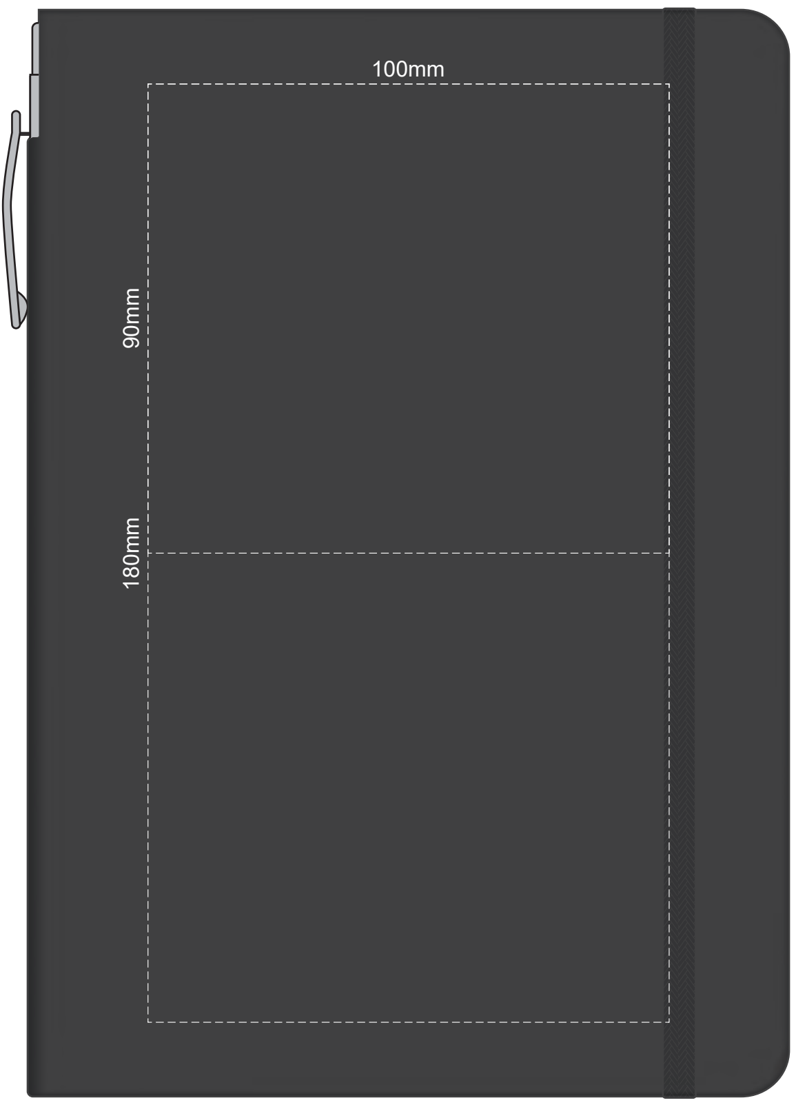
Print area 100 x 90mm is moveable within the XL deboss area and can rotate to suit.